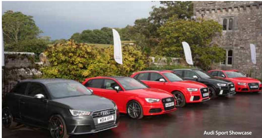
Audi Sport Showcase

Powderham Castle is the magnificent family home of the Earl and Countess of Devon. The Castle, built in 1392, sits within an ancient 200-acre Deer Park and enjoys breathtaking views across the Exe Estuary. Situated within beautiful private gardens, Powderham Castle is an exceptional venue for corporate events, conferences, receptions, formal dinners, charity events, product launches, Ride and Drive events and team building days. Powderham Castle's impressive architecture contains unique and varied interiors that make it a wonderful setting for film, television and photographic shoots.