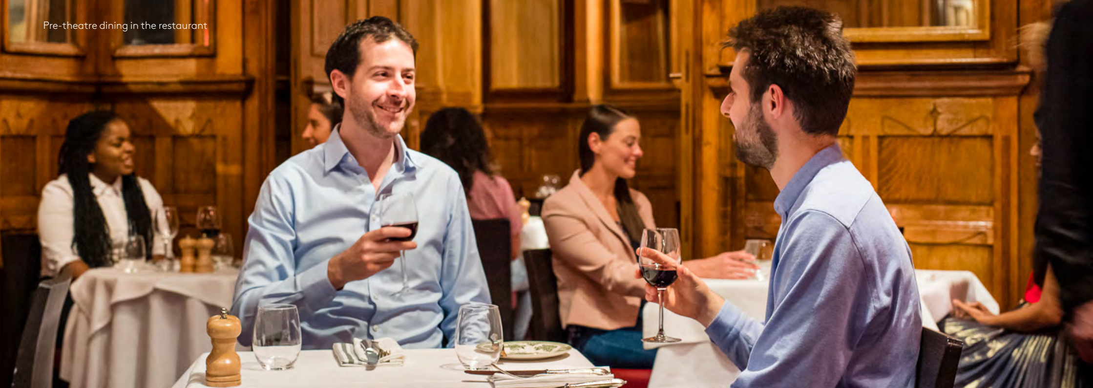
Pre-theatre dining in the restaurant