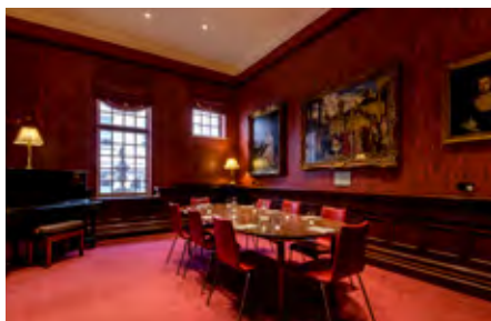
Boardroom set up