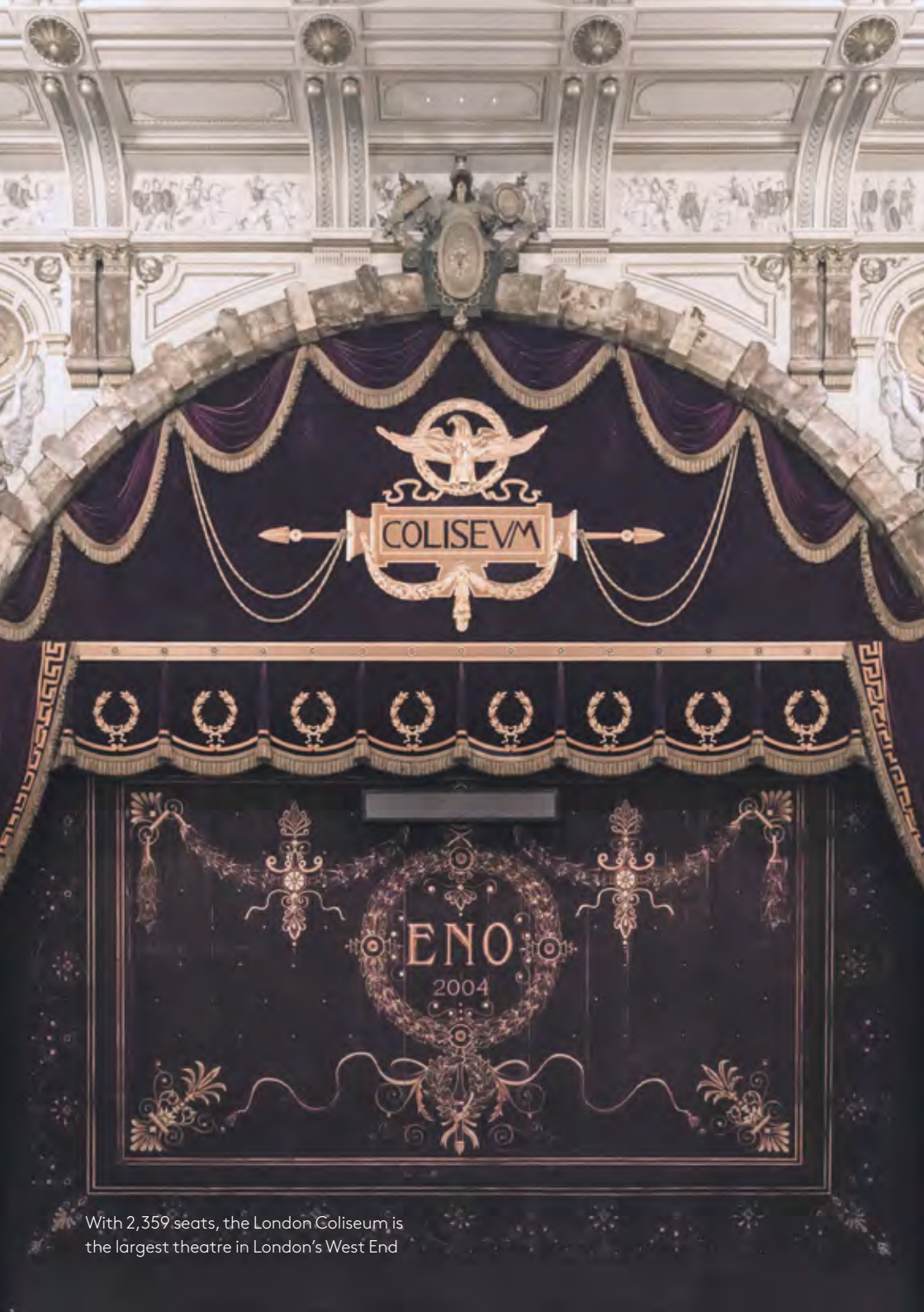
With 2,359 seats, the London Coliseum is the largest theatre in London's West End